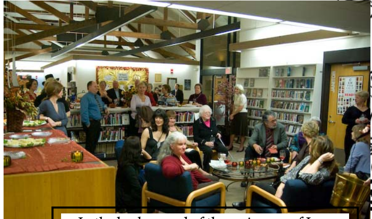
—In the background of the main area of Lane library, Gallo wine servers broadened guests' knowledge and palate for 12 different varieties of great wine. Guests also participated in a Silent Auction, held in the NH Room, and received engraved memento wine goblets.