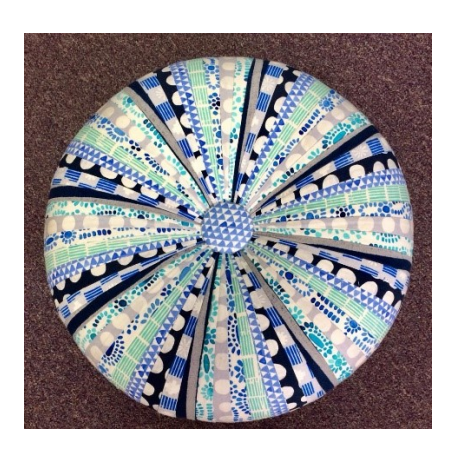
Little Miss Muffet sat on a tuffet ...

We all remember this nursery rhyme and while we may not have known what a tuffet (a footstool, a hassock, a low seat) was, we're sure Miss Muffet's tuffet could not have been as enticing as the one you create yourself!